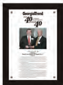
40 Under 40 Picture Plaque #2 $250.00

10-1/2" x 13" black gloss plaque with honoree's name and specialty in black on the silver-plated surface. Designed to hang on your office wall. $200.00